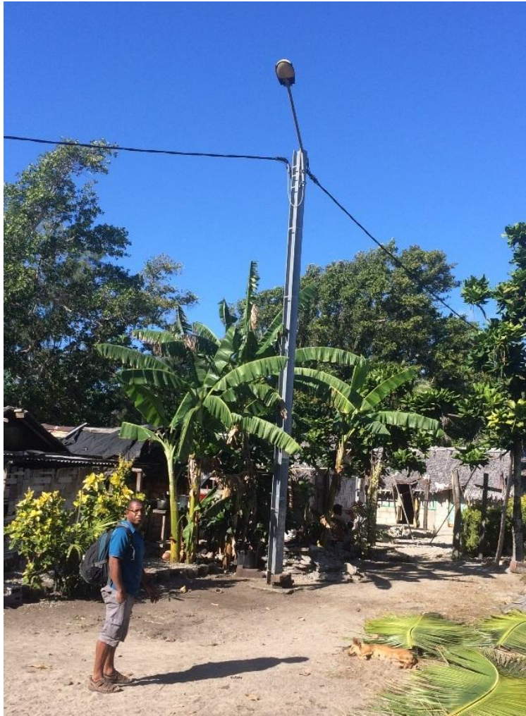
Figure 3 Power Pole and Distribution Lines