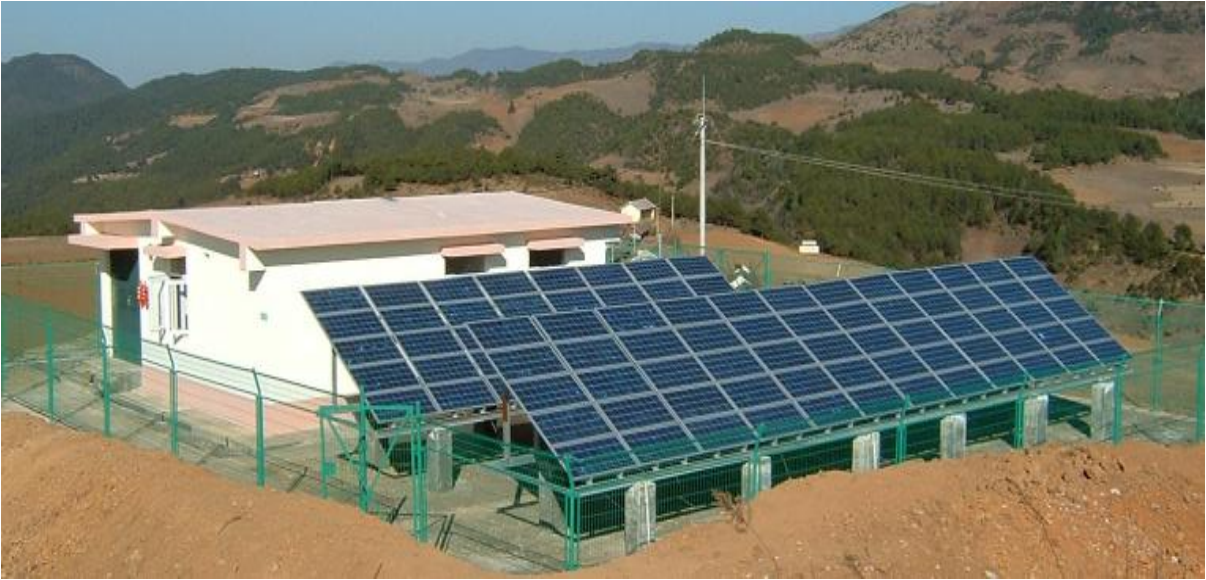
Figure 2 Solar PV Array and Battery/Genset Building